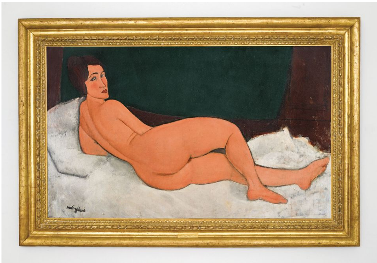
Modigliani's Nu couché (sur le côté gauche) (1917) had a $150m guarantee when it sold this year